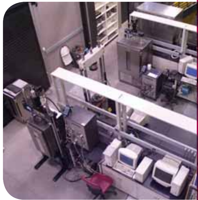
CEE Advanced Pavement Lab in the ISTB2 building

The conference will include nationally recognized speakers who will address the audience on National and Arizona perspectives of future transportation technology and how it affects our way of life. The conference will include sessions on asphalt and concrete pavements technology, recent innovations in pavement design and construction management, and updates on National NCHRP, Federal Highway Administration and ADOT pavement performance research. This year a transportation systems track has been added to serve the growing needs of Arizona's transportation systems community. Updates on the latest emerging construction technologies will also be included. Visit the conference website at www.fulton.asu.edu/paving for more details.