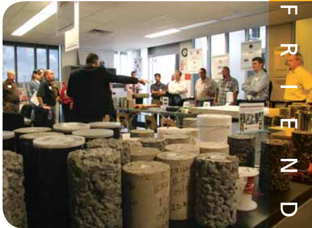
One of the many labs visited during the annual CEE Lab Tour held in March 2007 and sponsored by the Friends of Civil Engineering

is our industry support group that provides much needed discretionary funds to enable the department to assist students with educational and research activities with the end result of providing the civil engineering community with well-rounded, educated professionals. FOCE also supported our first CEE Laboratory Open House and several social events including our fall student mixer and a spring barbeque at an ASU/ UCLA baseball game. Continued membership growth has enabled us to consider supporting additional student programs in the coming year, including book scholarships for our seniors and financial support for the new Engineers Without Borders chapter at ASU. We are grateful to our FOCE members for the opportunities their support provides us. Information on FOCE membership can be found on the CEE website at http://cee.fulton.asu.edu or by calling the department office at (480) 965-1713.