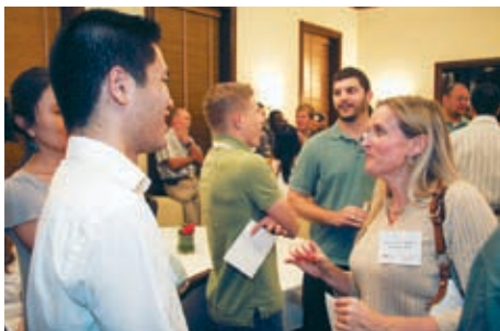
Above: CEE students and FOCE members attend the 2008 FOCE Mixer held at the University Club

When we started FOCE, we formed a steering committee made up of a number of dedicated leaders from both academia and industry. This group has helped solicit industry participation and act in an advisory capacity to the Chair.