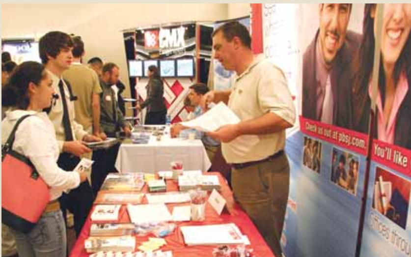
Students and Friends of Civil Engineering at the 2006 Career Fair